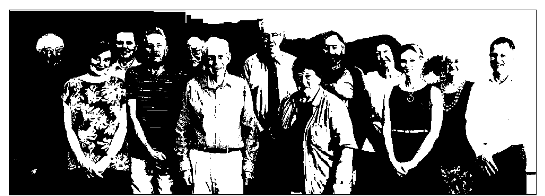
Members of the Heritage Advisory Committee at the Committee's meeting held on 03 March 2014.