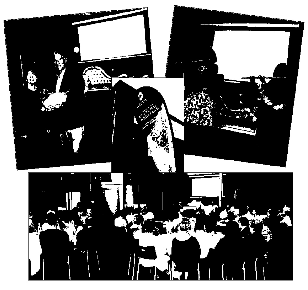
The Inaugural Cultural Heritage Awards 2013 ceremony held in The Vault, Shepparton on Saturday, 20 April 2013.

A Cultural Heritage Awards 2015 Workshop was held on Monday, 2 September 2013, reviewing the operation of the 2013 Awards and beginning to plan for the 2015 Awards.