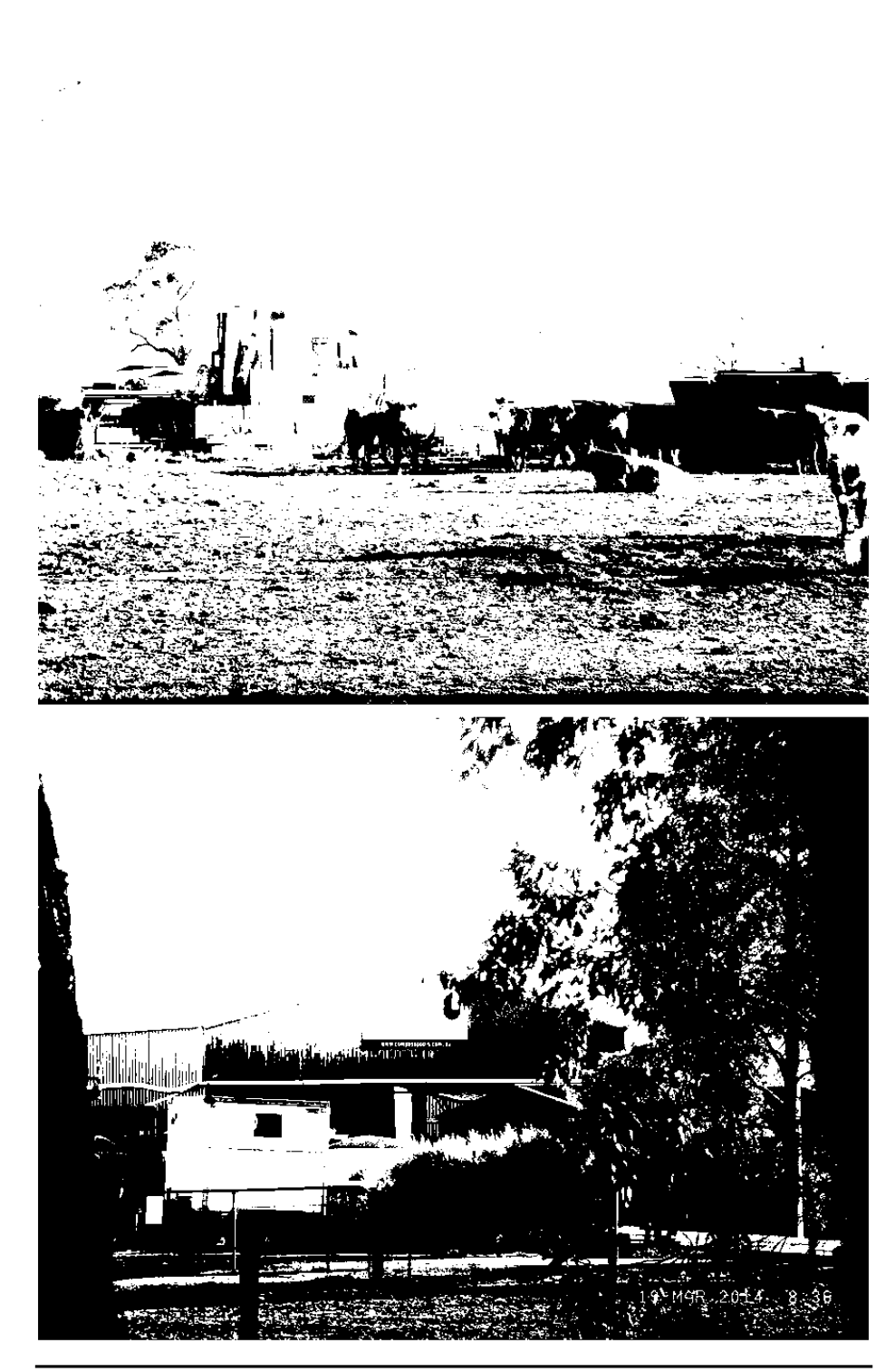
Permit/Site History The history of the site includes: