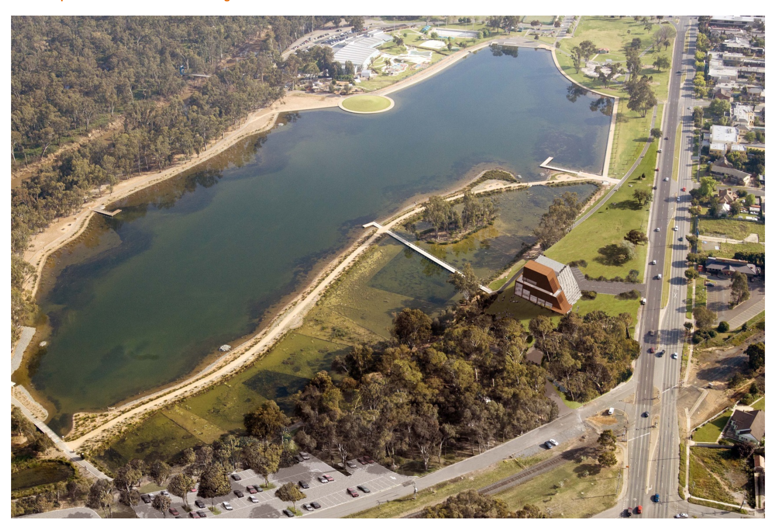
Artists impression of how the new building could fit into the site