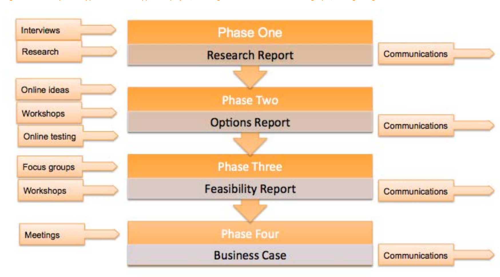
Figure 1. The four-phased approach used to support the project, receiving consultation and market testing input, and signalling communication to stakeholders