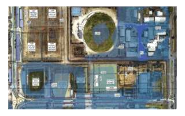
Munarra Concept Design - From Munarra Master Plan