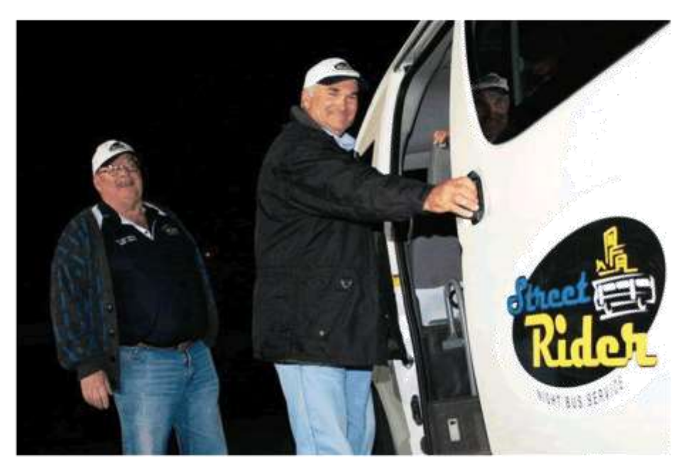
Street Rider Volunteers

(Sourced from the Australian Bureau of Statistics 2016.)