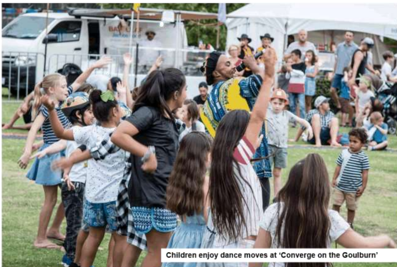
Children enjoy dance moves at 'Converge on the Goulburn'

Australian Bureau of Statistics (ABS) figures show that the 'Total Overseas – Born' statistic for Greater Shepparton is 9,500 persons. Whilst the ABS is the only formal measure of population, anecdotal evidence from local sector organisations suggest that the overall number of people born overseas is likely to be under represented for Greater Shepparton.