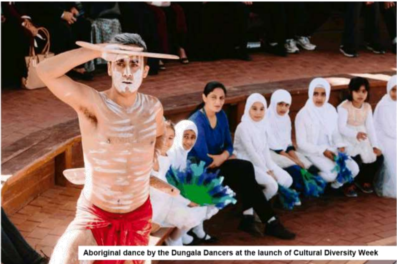
Aboriginal dance by the Dungala Dancers at the launch of Cultural Diversity Week

We, the Greater Shepparton City Council, acknowledge the traditional owners of the land which now comprises Greater Shepparton. We pay respects to their tribal elders, we celebrate their continuing culture and we acknowledge the memory of their ancestors.