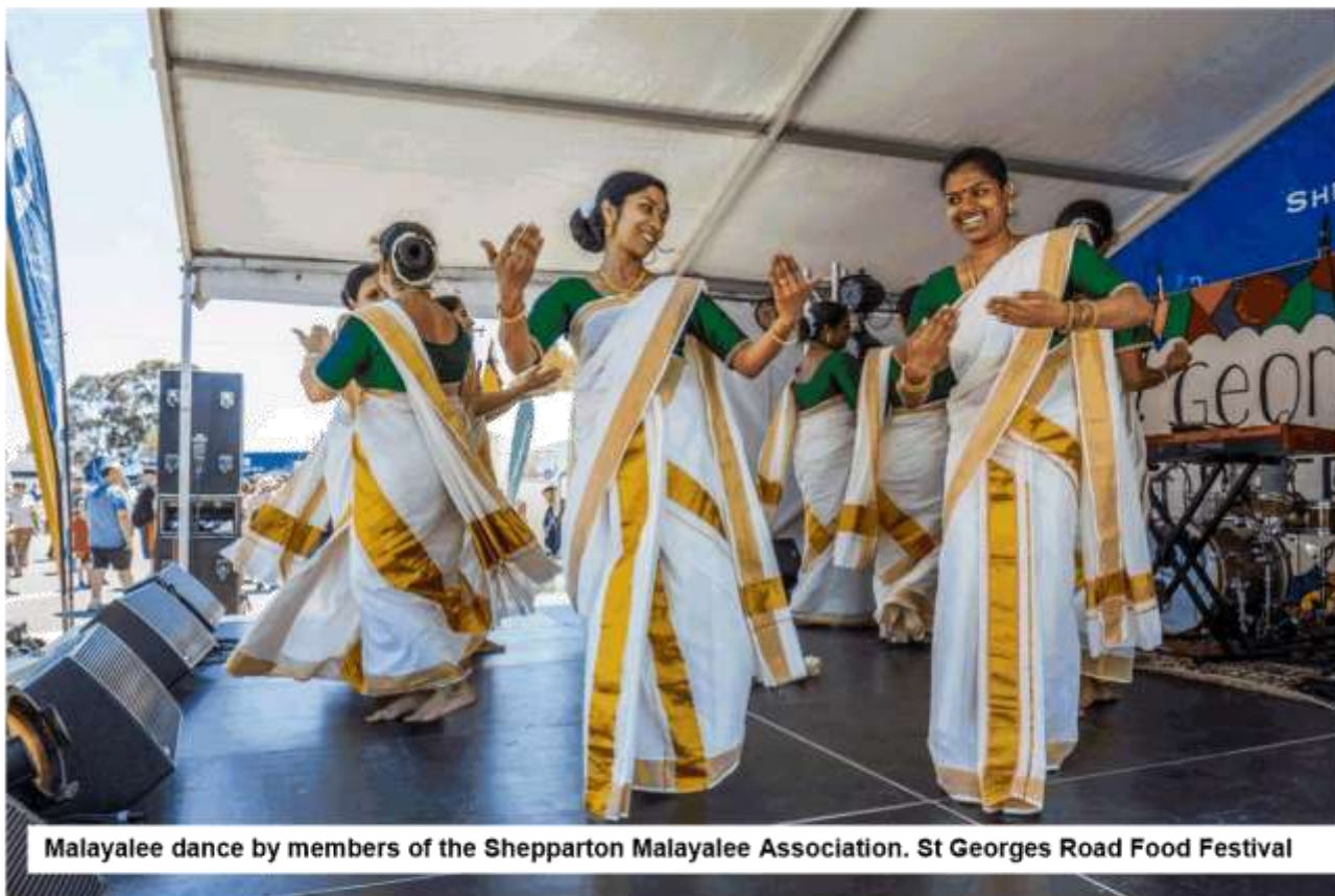
Malayalee dance by members of the Shepparton Malayalee Association. St Georges Road Food Festival

Council will continue to work towards creating a more vibrant, cohesive community that celebrates and incorporates aspects of cultural diversity within daily life. It is essential that we continue to be a welcoming place for migrants and multiculturalism into the future and provide appropriate services specific to multicultural communities.