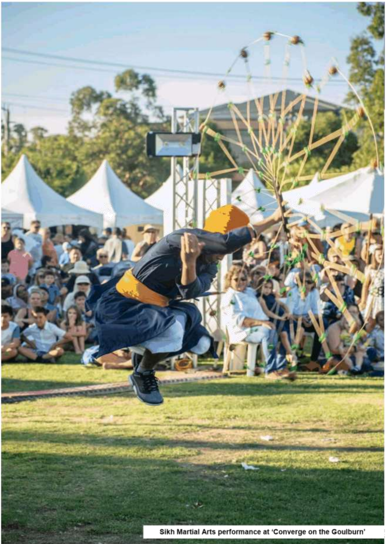
Sikh Martial Arts performance at 'Converge on the Goulburn'