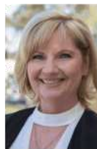
Cr Kim O'Keeffe Mayor Greater Shepparton City Council

A handwritten signature in black ink that reads 'Kim O'Keeffe'.