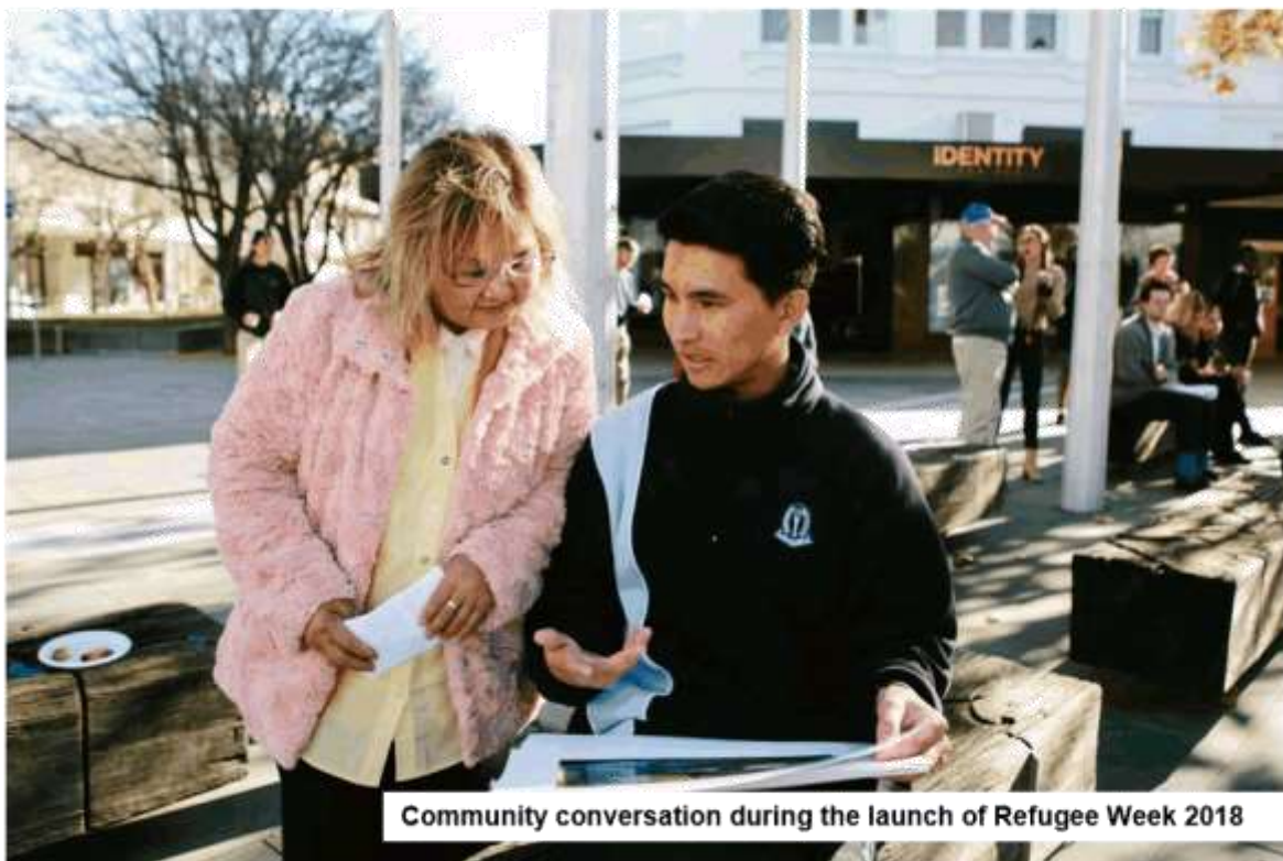
Community conversation during the launch of Refugee Week 2018

As our community in Greater Shepparton continues to embrace inclusiveness and develop a greater understanding of multiculturalism, this Strategy takes a holistic view on all multicultural opportunities. The previous Cultural Diversity and Inclusion Strategies set the foundation for this new Multicultural Strategy. This Strategy places a stronger emphasis on acceptance and understanding whilst encapsulating the celebration of cultural diversity.