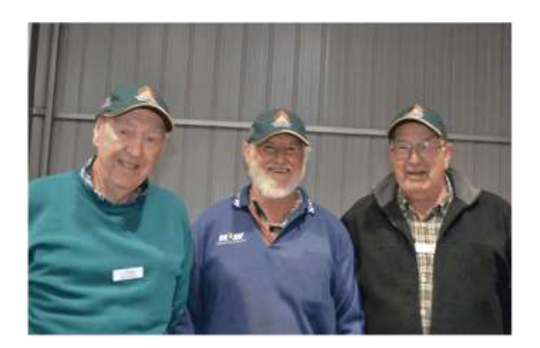
Some of the Tallygaroopna Men's Shed members.