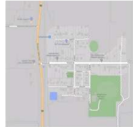
Shepparton is 16km's south of Tallwarnonna