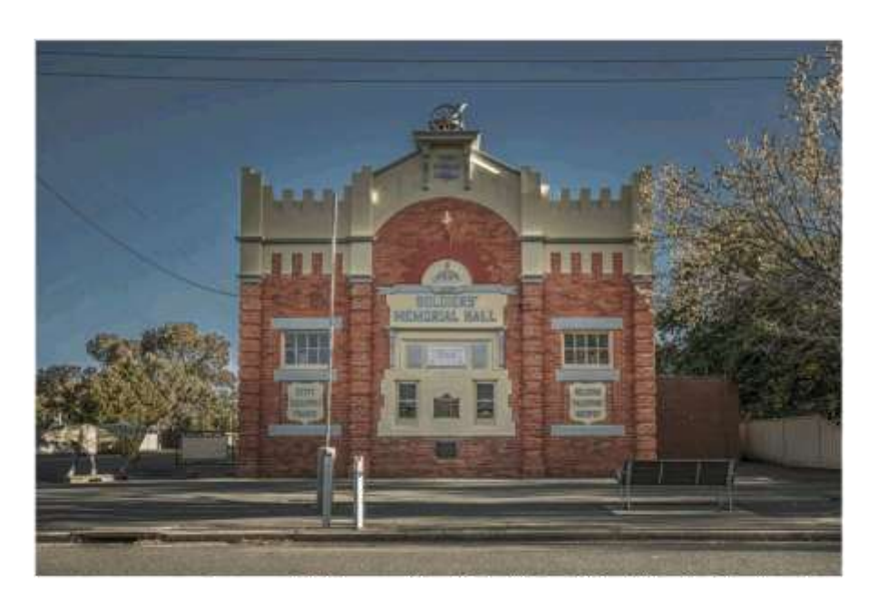
Tallygaroopna Soldiers' Memorial Hall