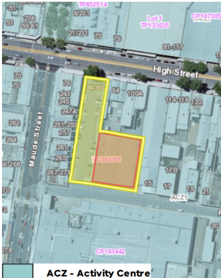
Figure 1: Extract of the Zone Map for High and Rowe Streets Car Park (outline in yellow) with the subject site outlined in red.

(2020 Act) requires Council to publish a notice of its intention to sell the land and undertake a community engagement process in accordance with its Community Engagement Policy