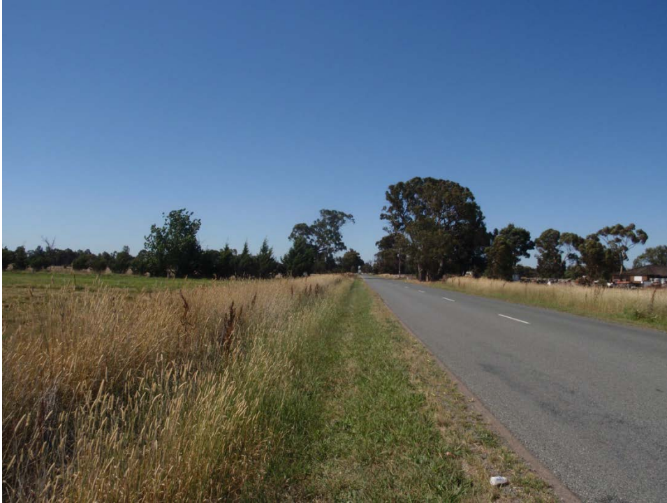
Looking North down Archer Road across frontage of subject land