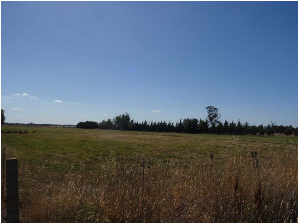
Subject land, existing power line easement