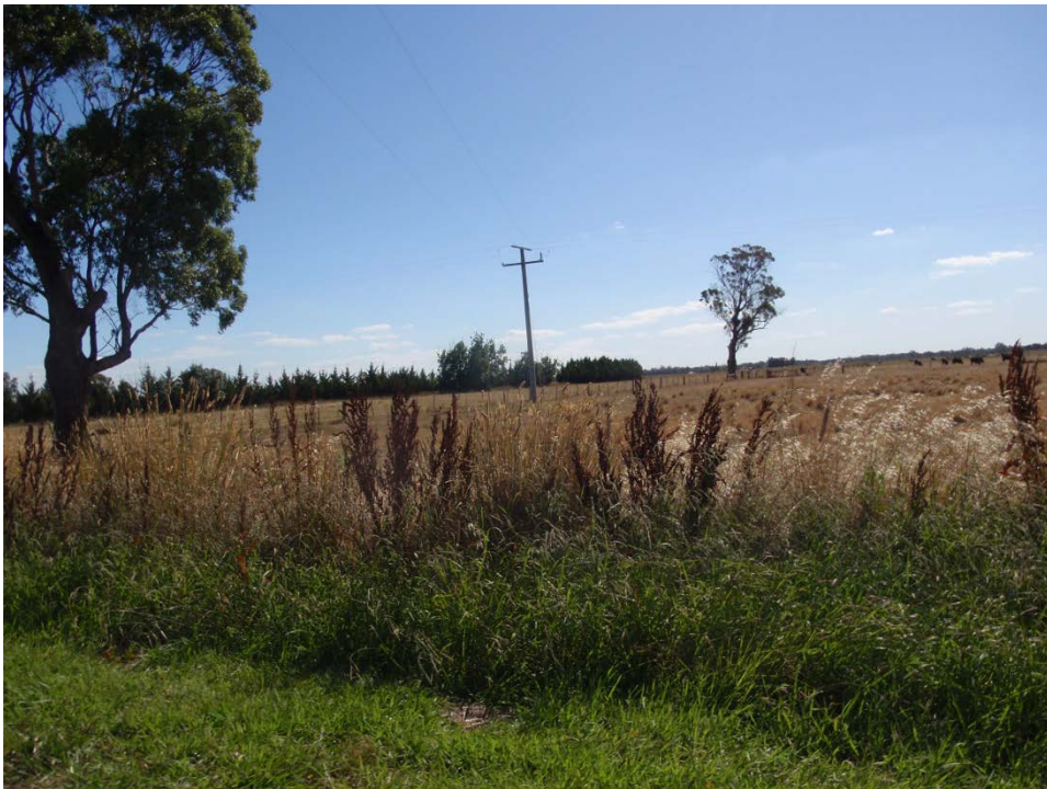
Subject land with existing power line