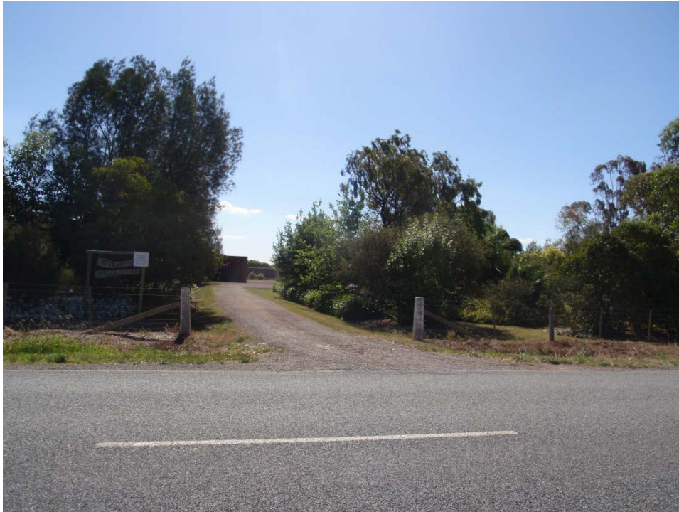
Access to subject property from Archer Road

The Photos below show the existing site: